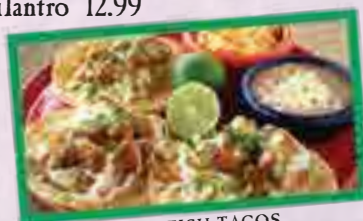
BAJA FISH TACOS

Fried cod with jalapeño coleslaw, cilantro-lime crema, onions and cilantro 12.99