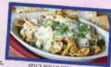
SPICY POLLO VERDE BAKE

Marinated chunks of chicken breast sautéed with lime, fresh jalapeño, mushrooms, black bean and corn salsa. Topped with cheese and verde sauce, then baked over cilantro-lime rice. Served with cheese-covered tortilla chips 13.99