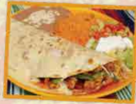
QUESADILLA DE FAJITAS

One quesadilla with your choice of marinated steak or chicken, green peppers, onions and diced tomatoes. Topped with chile con queso. Served with refried beans, Spanish rice, shredded lettuce, diced tomatoes and sour cream Chicken 14.99 Steak* 15.99